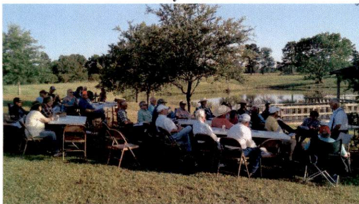
Panola Farm Pond Field Day May 17th